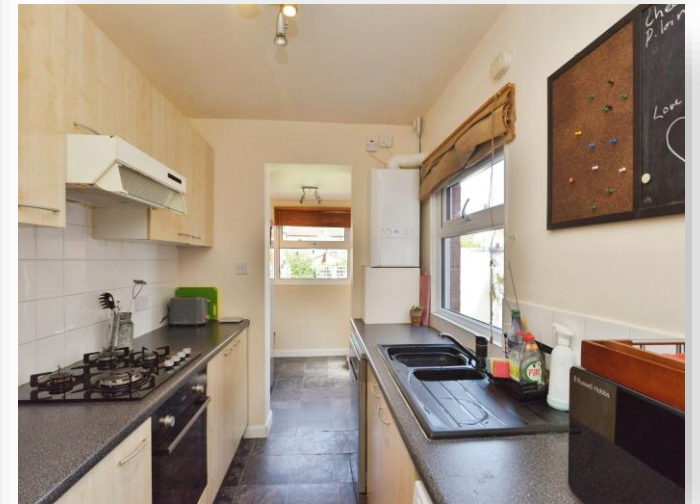
St. Mary Street, New Bradwell Milton Keynes MK13 0BD