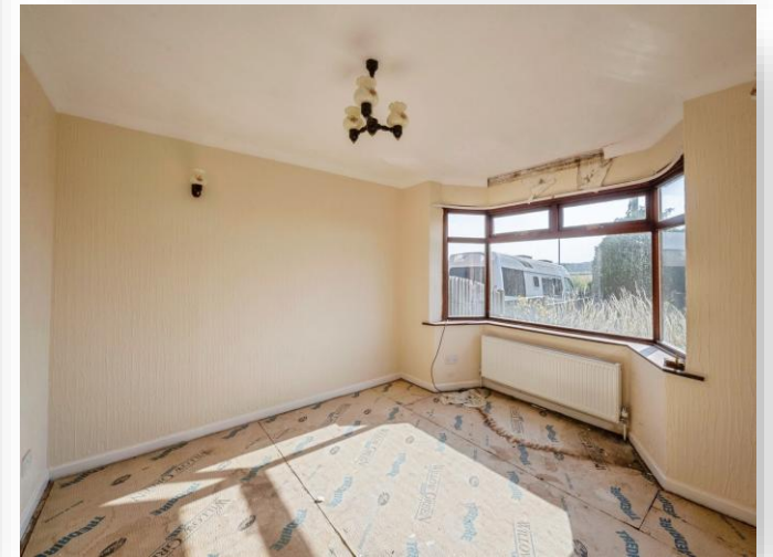
Clayton Lane, Thurnscoe Rotherham S63 0RX