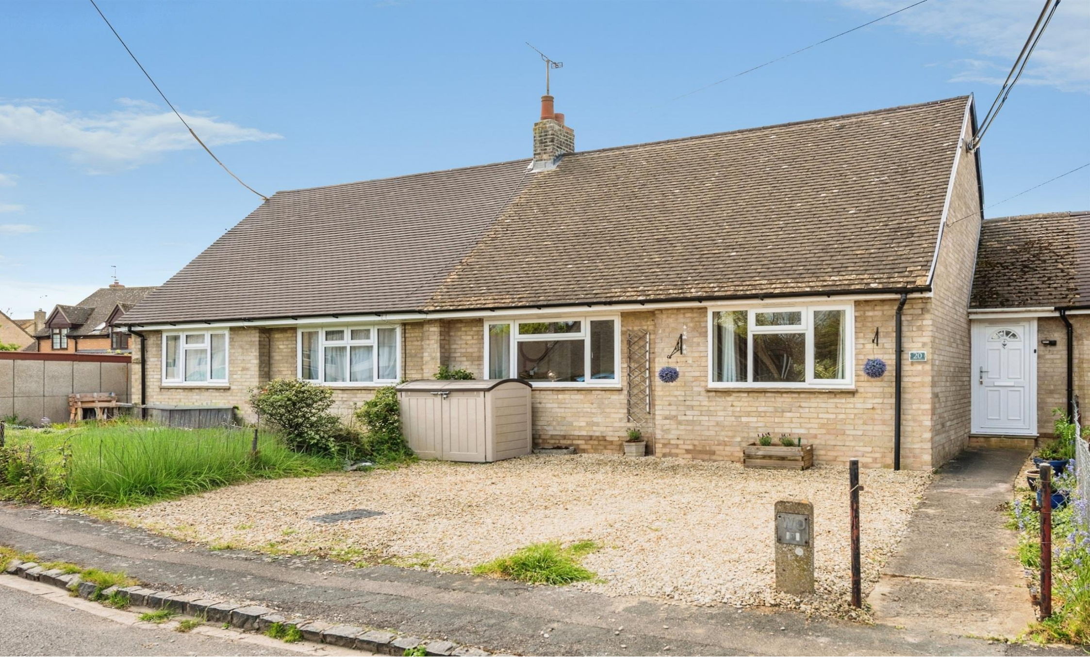
Flexneys Paddock, Stanton, Harcourt, Witney, OX29 5RS