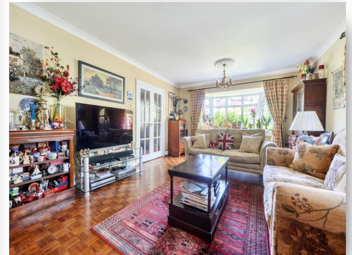
4 Courthouse Road, Maidenhead SL6 6JD