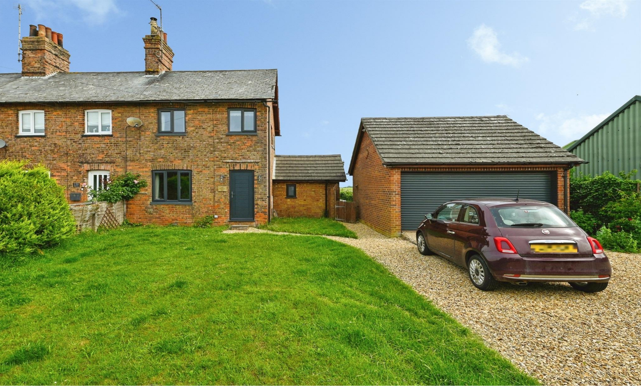
Sutton Road, Walpole Cross Keys, King's Lynn, PE34 4HE