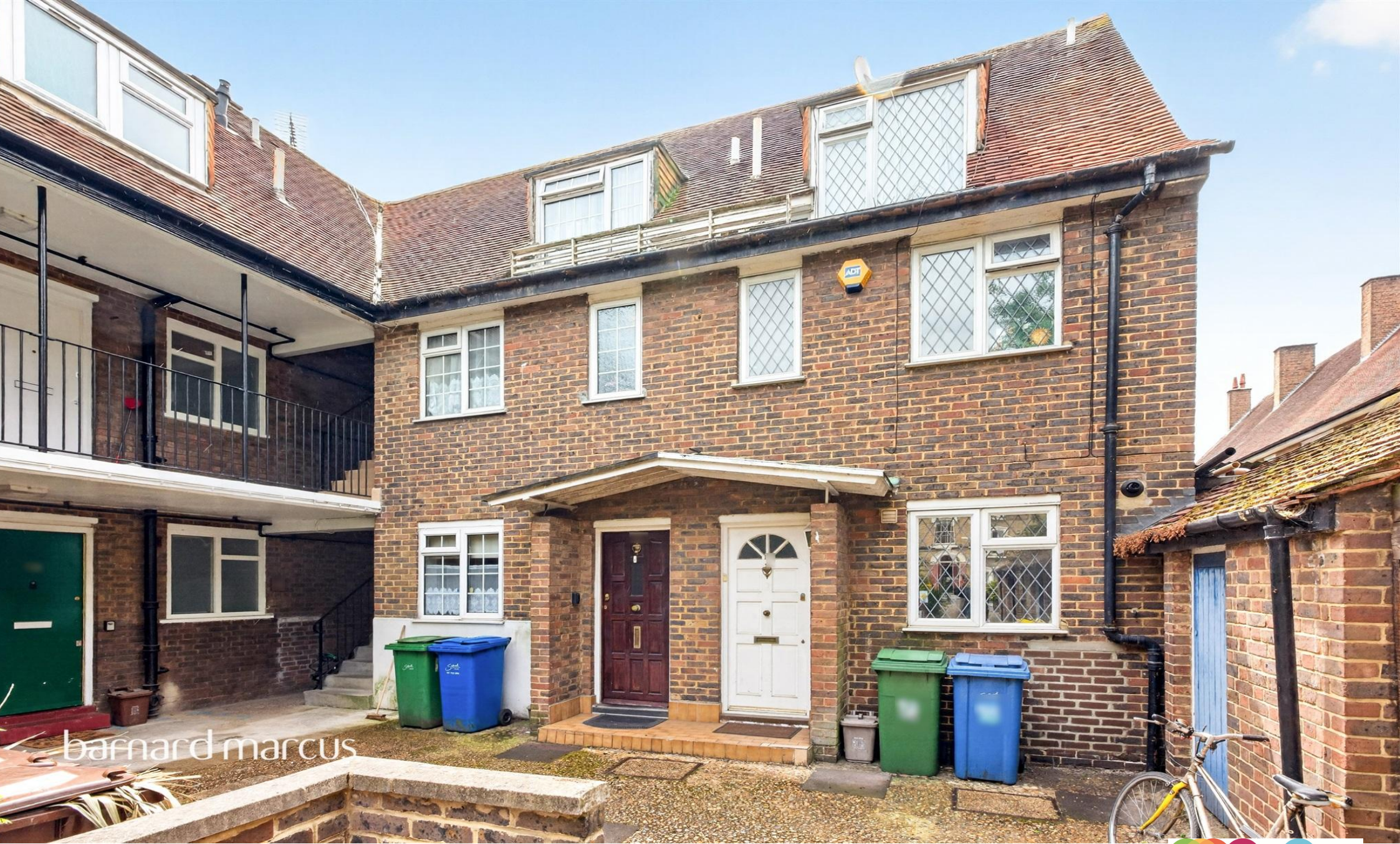
Penton Place, London SE17