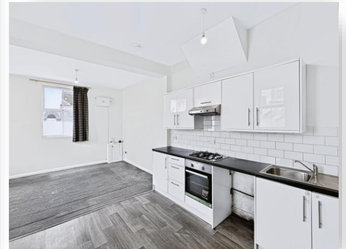
Oakley Street, Northampton NN1 3EP