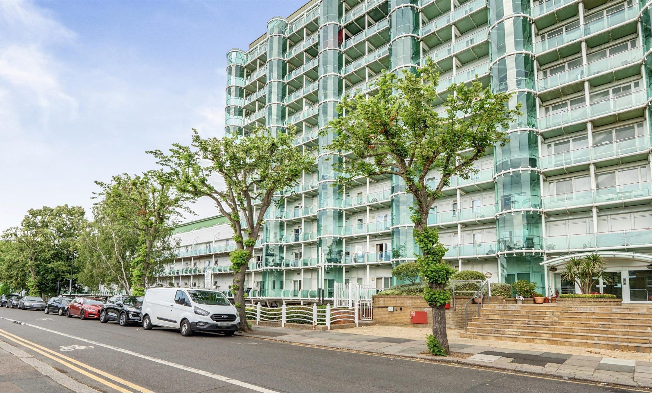
Tower Point, Sydney Road, Enfield, EN2 6SZ