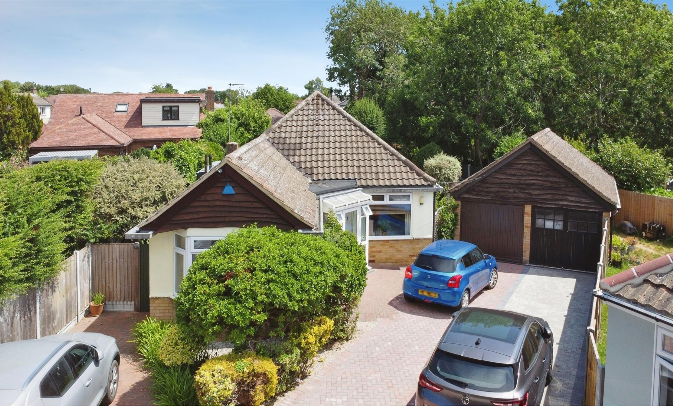
Priory Close, Pilgrims Hatch, Brentwood, CM15 9PZ