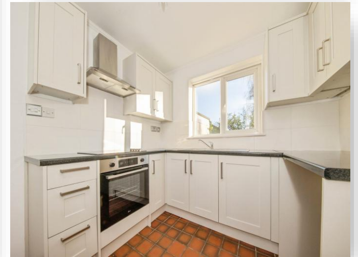
Cardigan Street, Ipswich, IP1 3PF