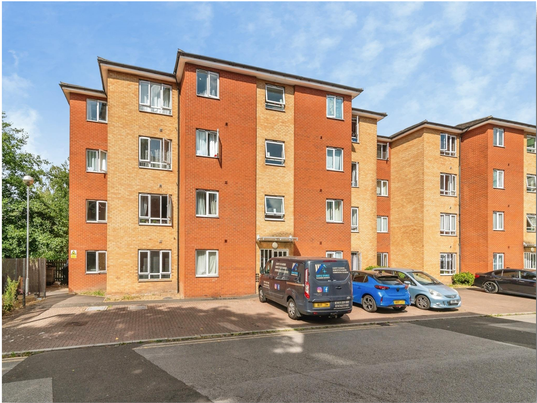
Brook Court Player Street, Nottingham NG7 5PP