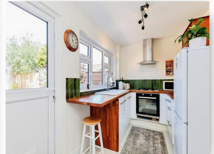
Spencer Street, Burton Latimer KETTERING NN15 5SQ