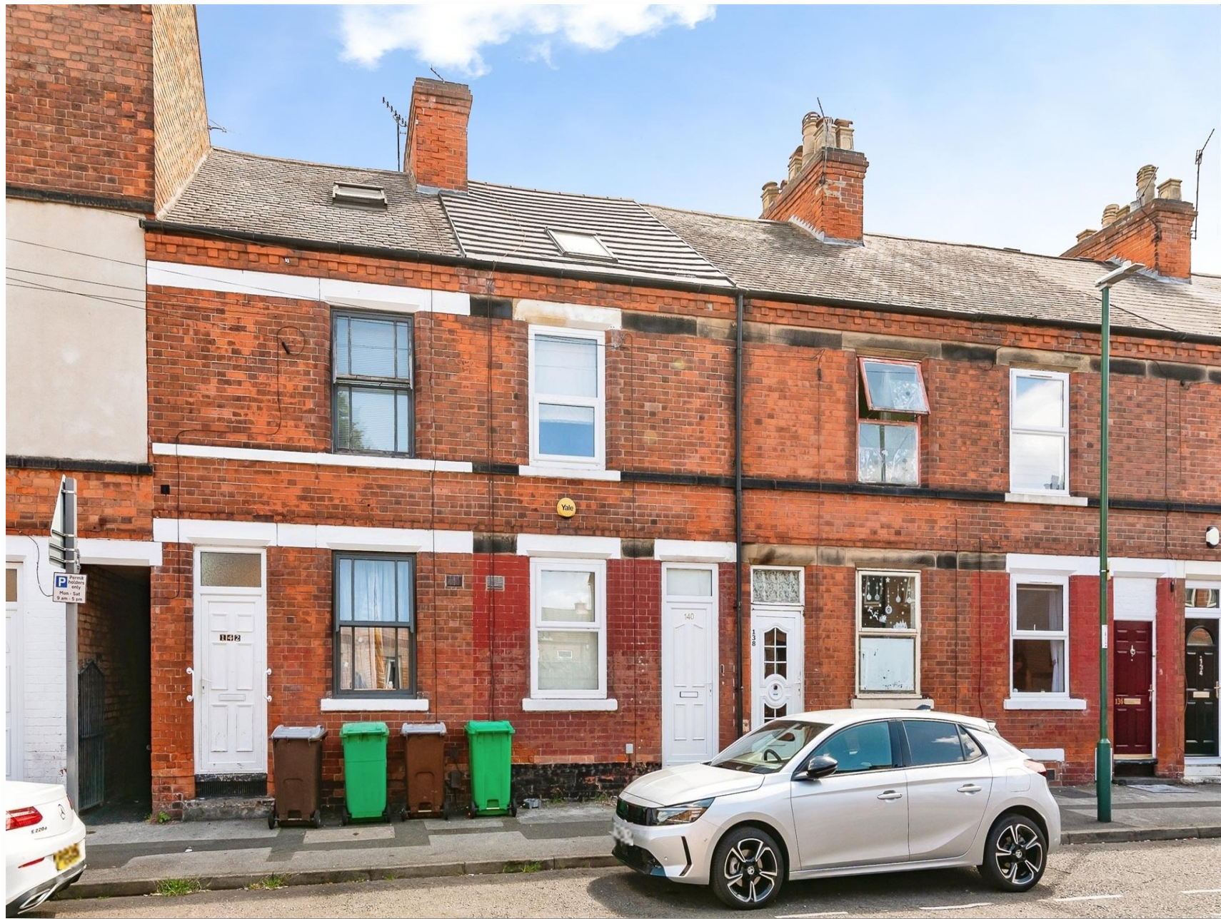
Forster Street, Nottingham NG7 3DD