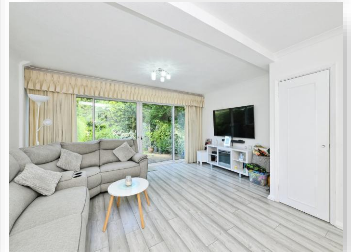
Cedar Green, Hoddesdon EN11 8BZ