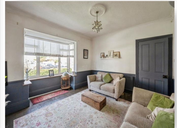
Chapel Street, Wath-Upon-Dearne Rotherham S63 7RL