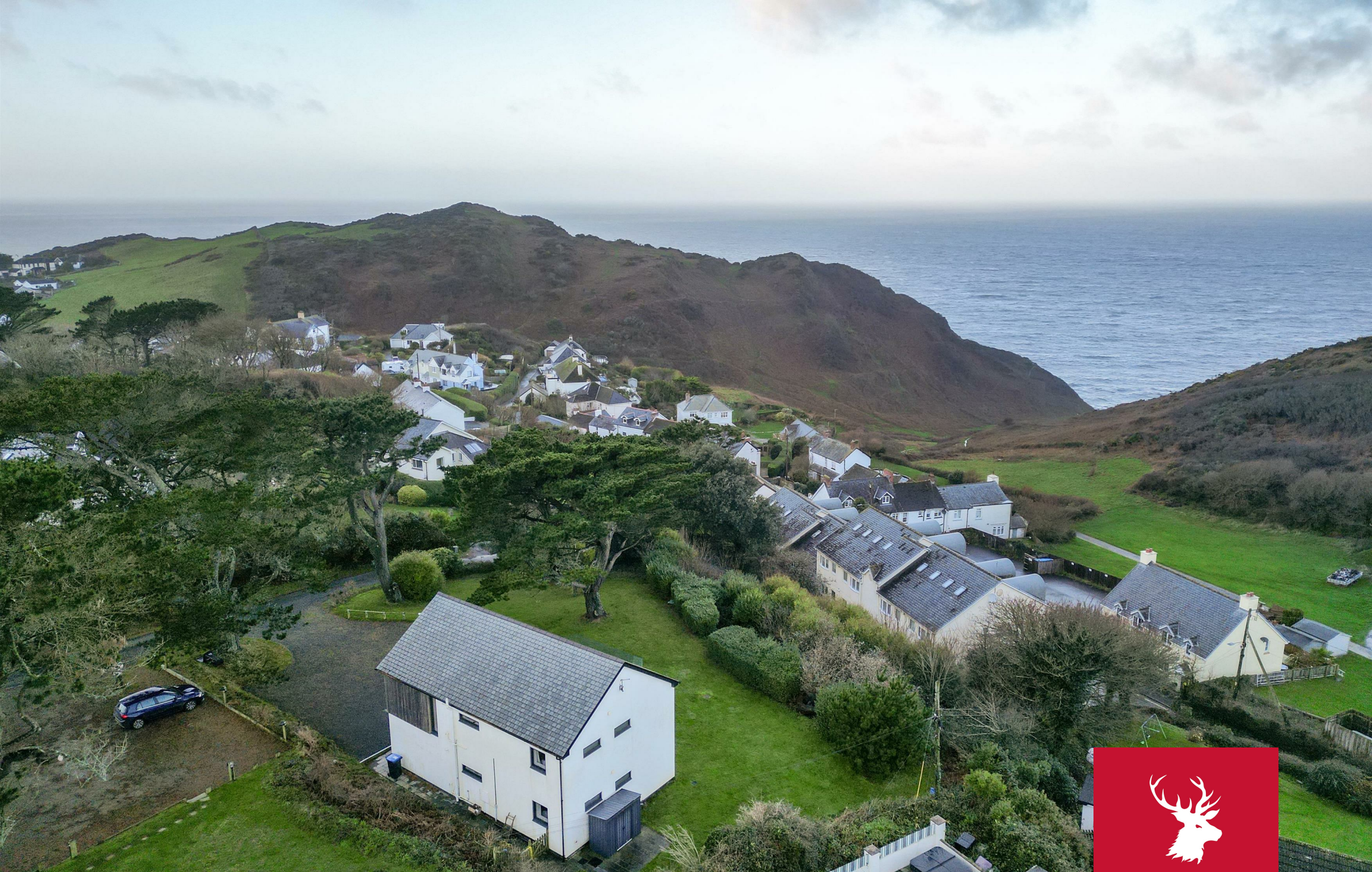
High Tide House