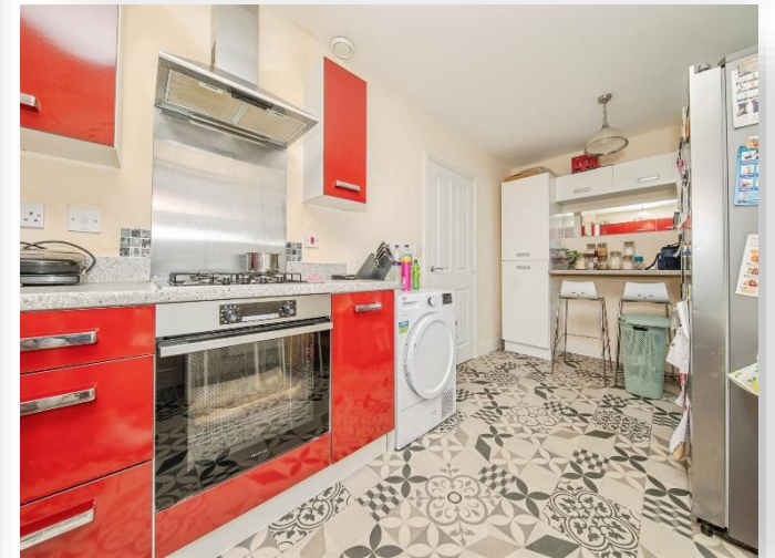
Hawes Street, Ipswich, IP2 8RL