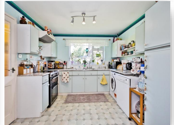
Osborne Road, Yeovil, BA20 1BZ