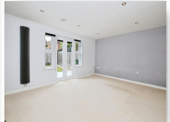
Foxglove Close, Yaxley Peterborough PE7 3GW