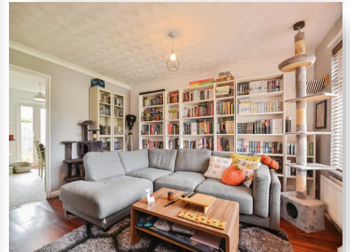
Hazelbank, Coulby Newham Middlesbrough TS8 0TH