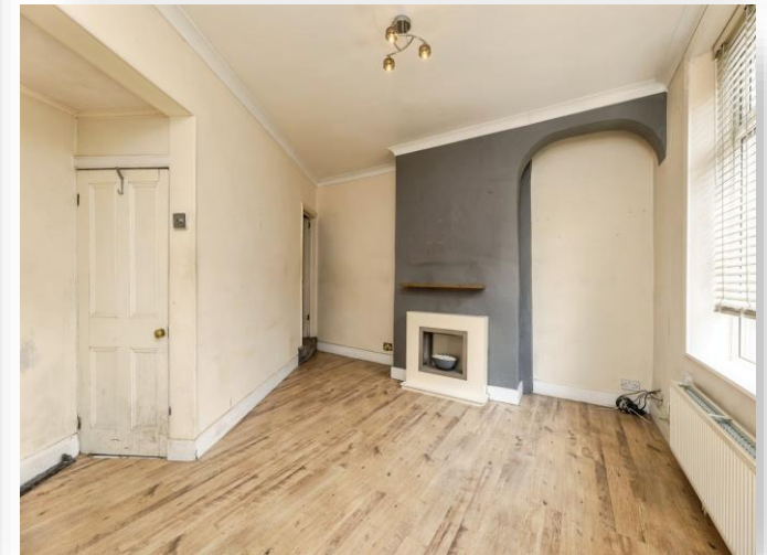
Ackroyd Street, Morley Leeds LS27 8QX