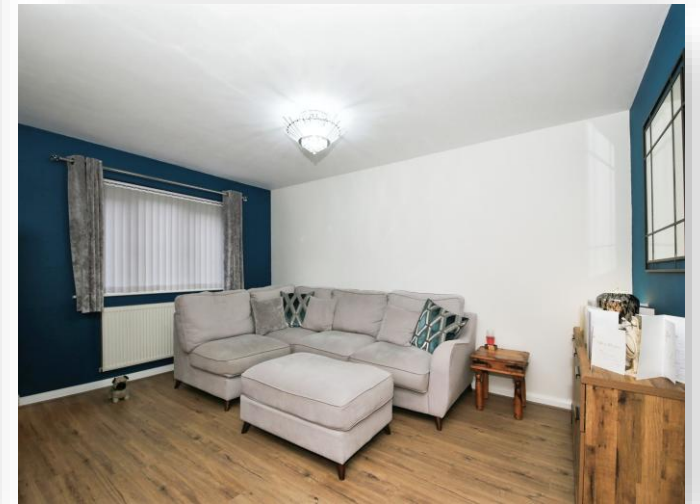
Beechings Close, Wisbech St. Mary Wisbech PE13 4SS