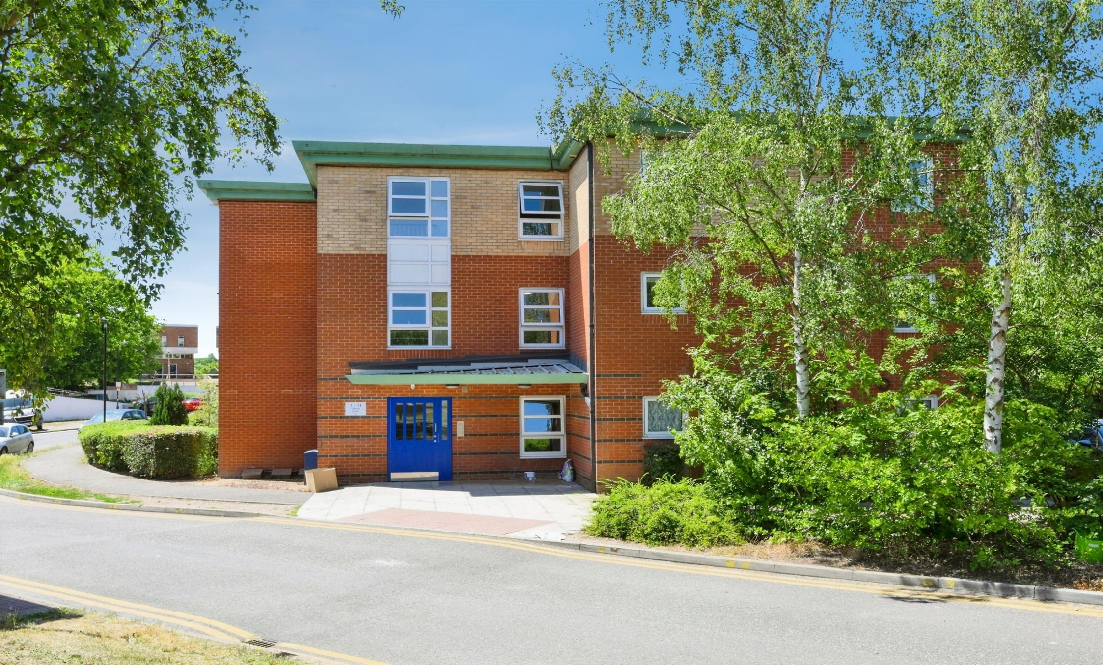
Gibson Court Bishopsfield, Harlow CM18 6FF