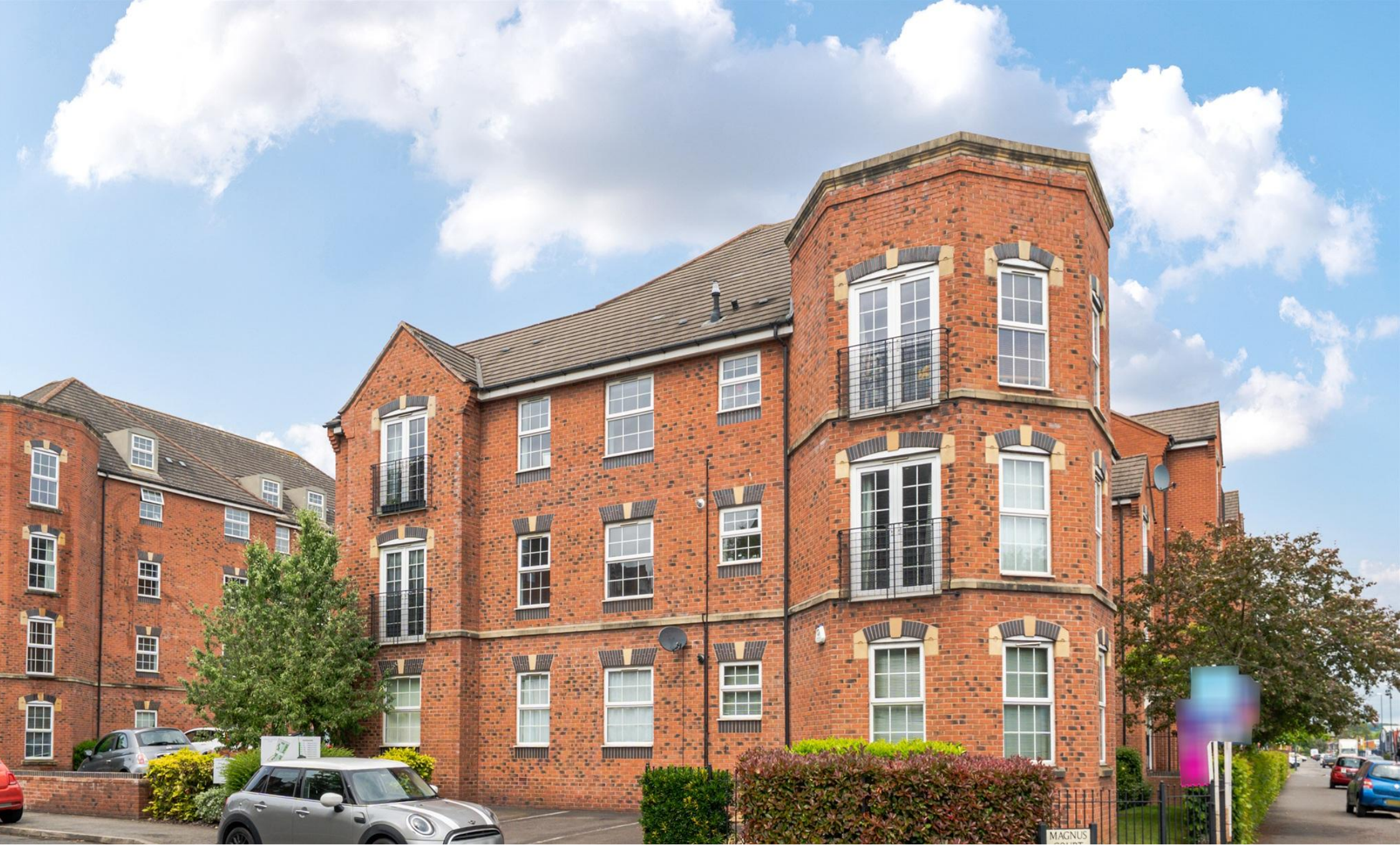
Magnus Court, Derby DE21 4TR