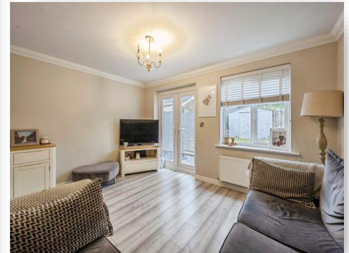
Smithy Croft, Bolton-Upon-Dearne Rotherham S63 8FG