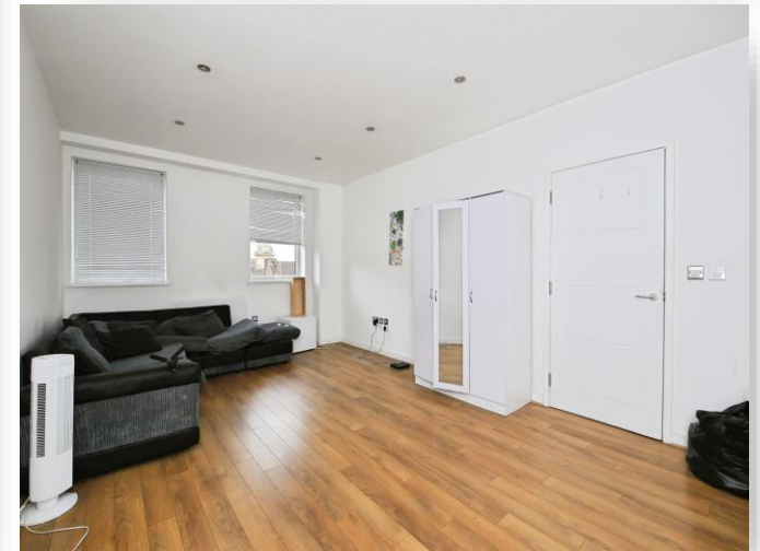
18 Cathedral View Wentworth Street, PETERBOROUGH PE1 1DS