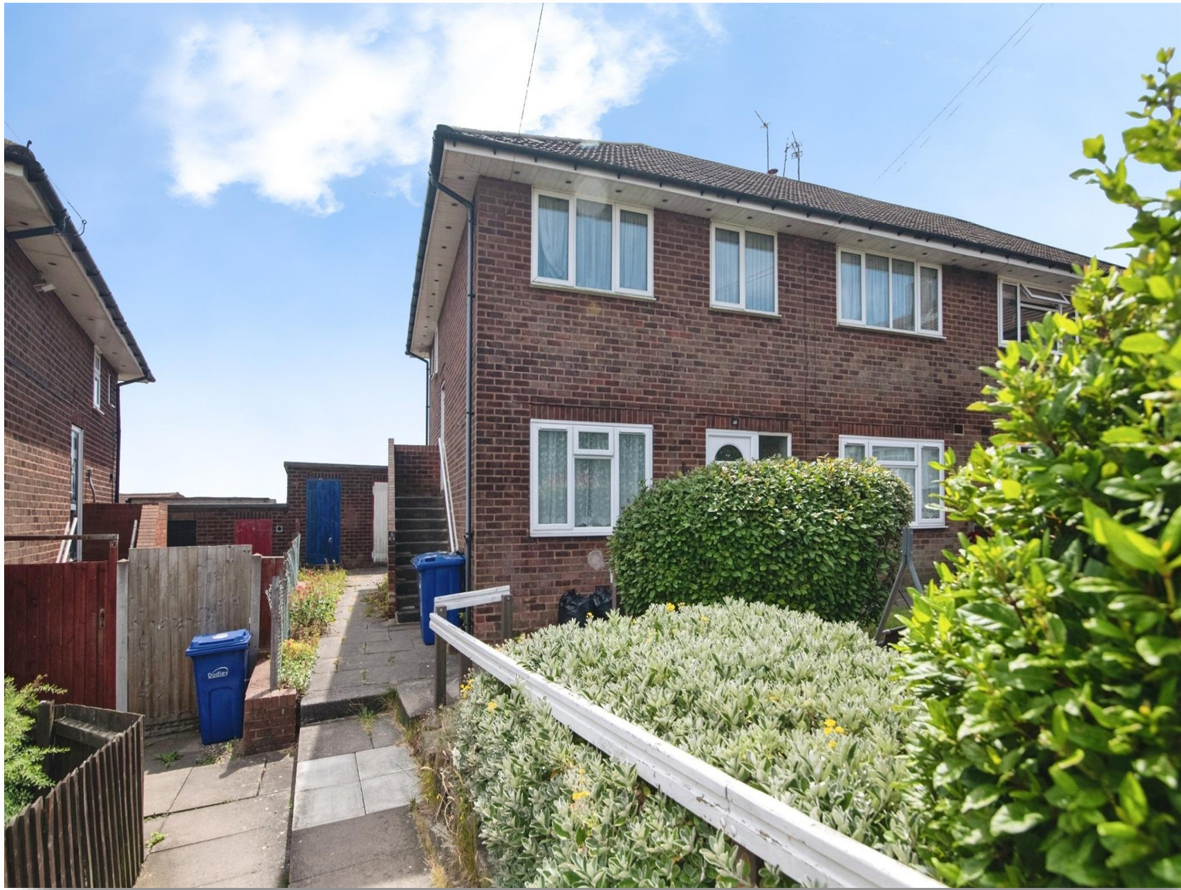
Hilary Crest, Upper Gornal Dudley DY3 2DH