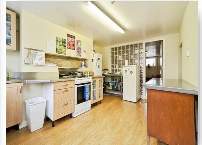
Spencer Place, Leeds LS7 4DU