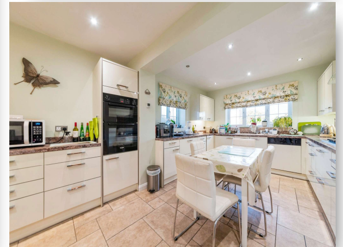
Little Orchard Hargon Lane, Winthorpe Newark NG24 2NP