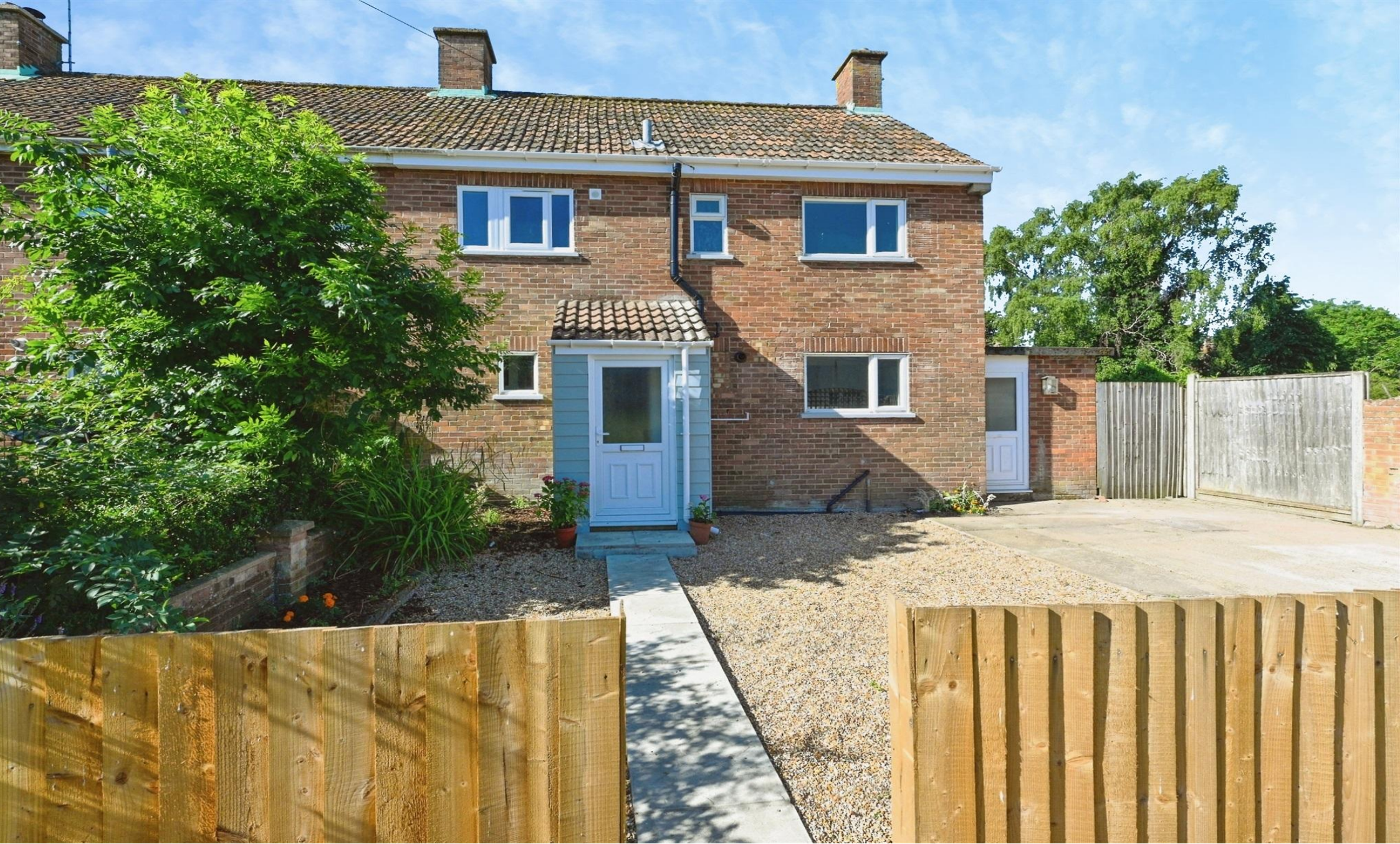
Thurlin Road, Gaywood, King's Lynn, PE30 4PG