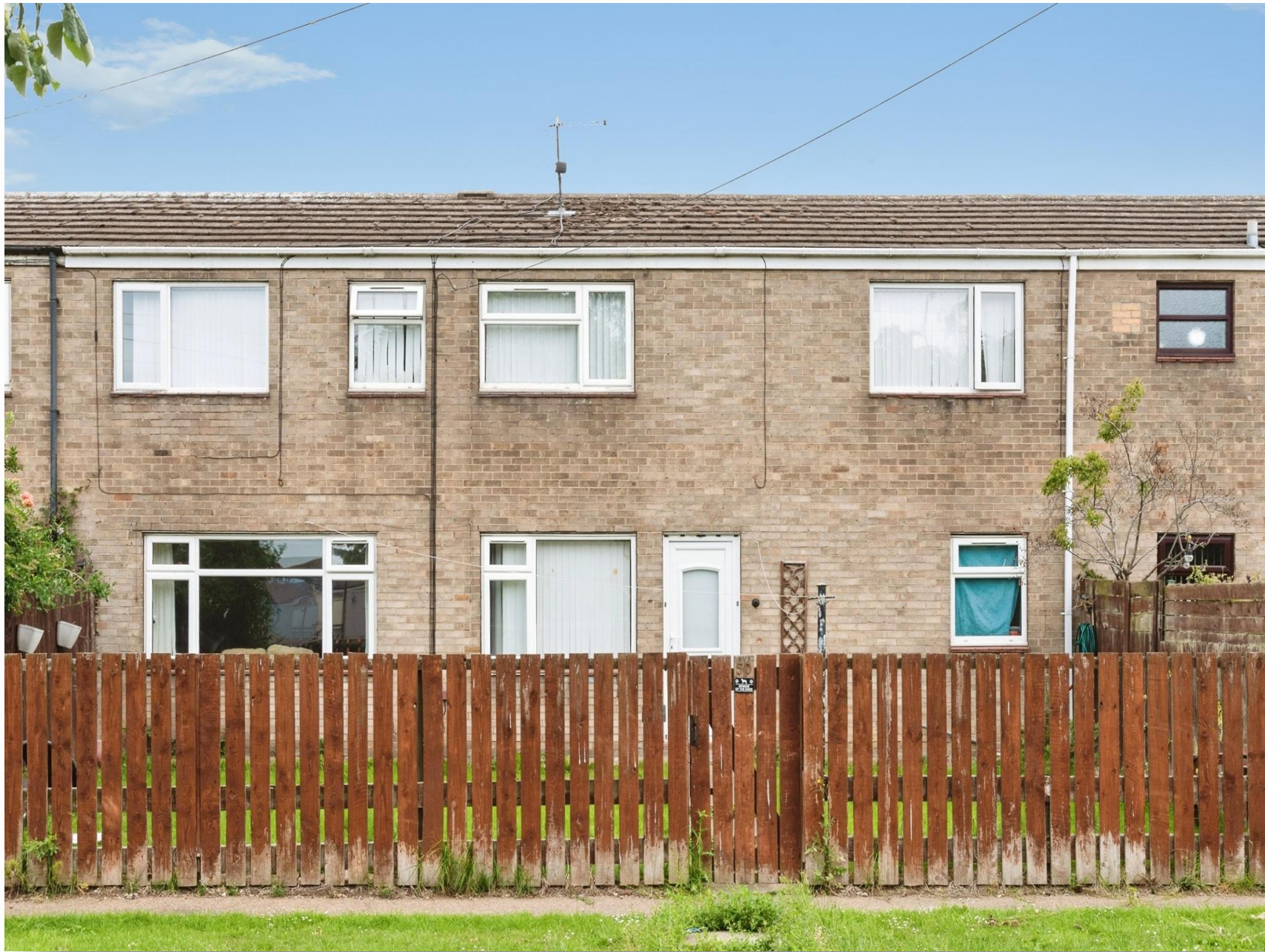
Axminster Close, Bransholme, Hull, HU7 4SF