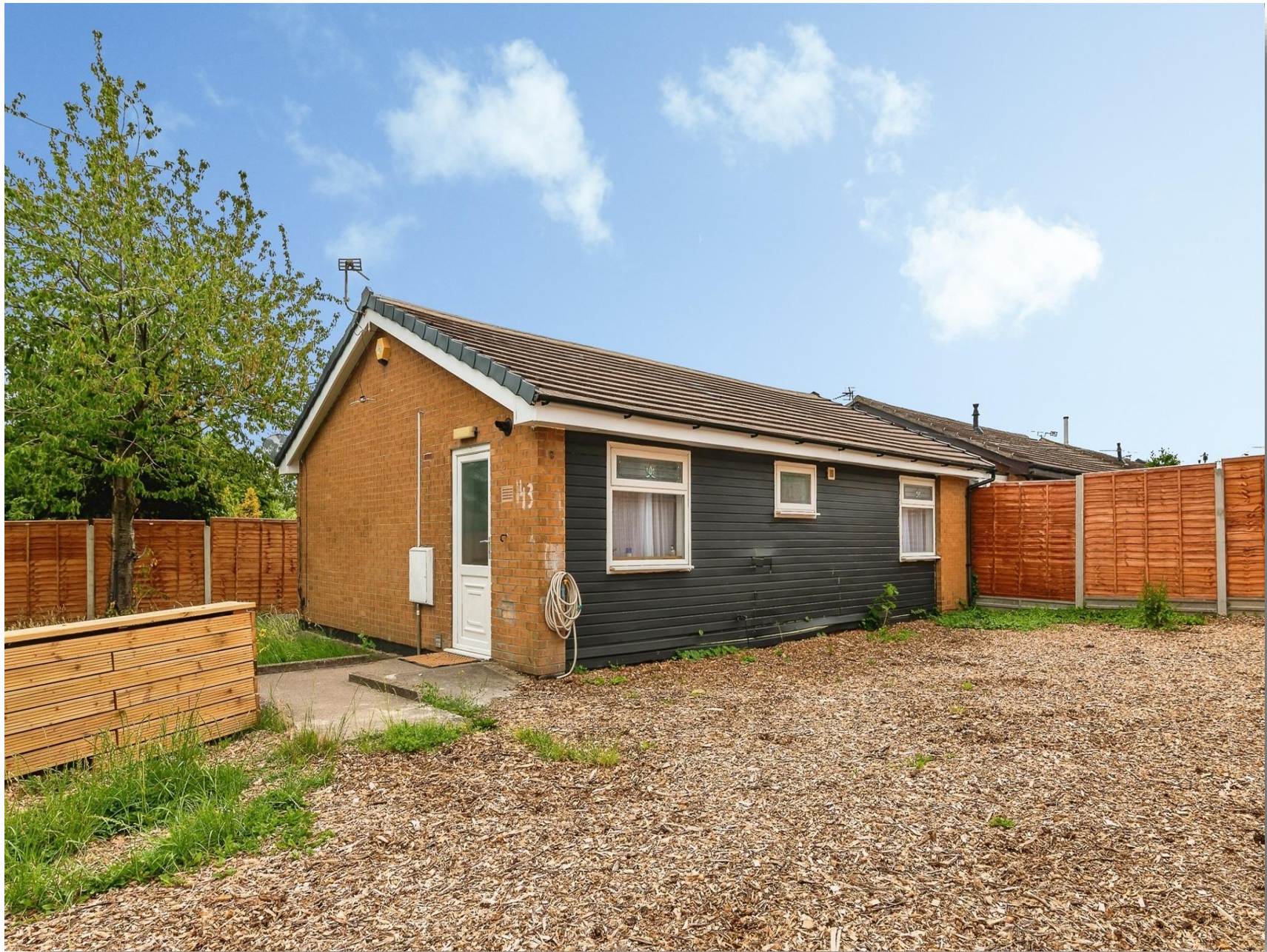
Wigman Road, Nottingham NG8 4PF