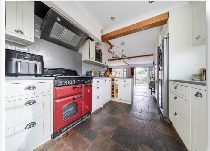
9 Juniper Drive, Maidenhead SL6 8RE