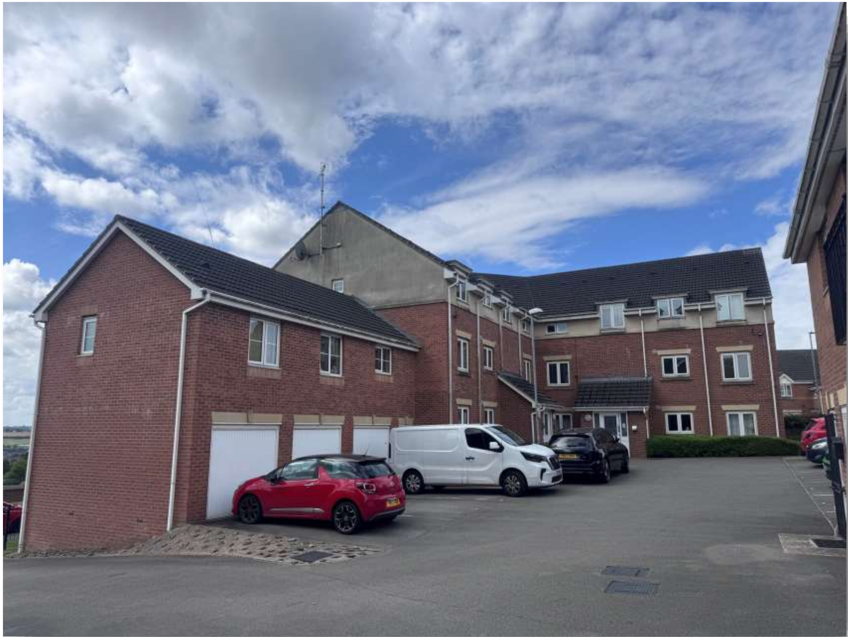
Hill End Crescent, Leeds LS12 3PW