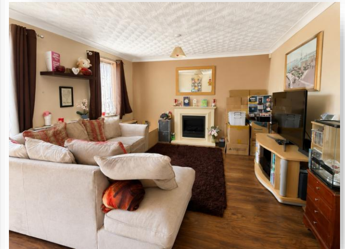
Helm Close, Gosport PO13 9XG