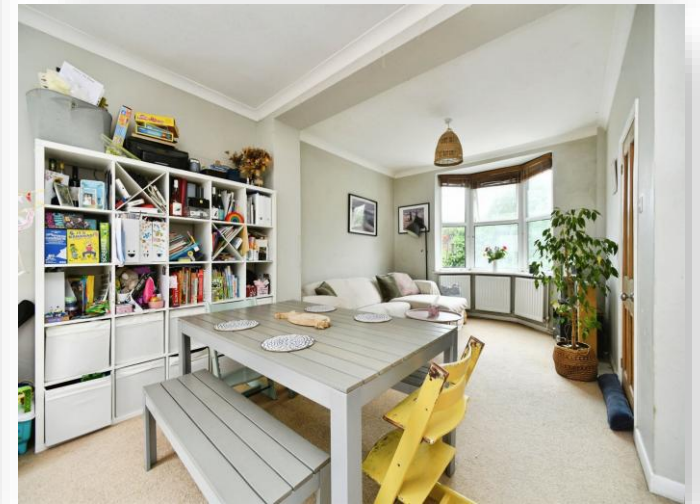
Beaufort Terrace, Brighton BN2 9SU