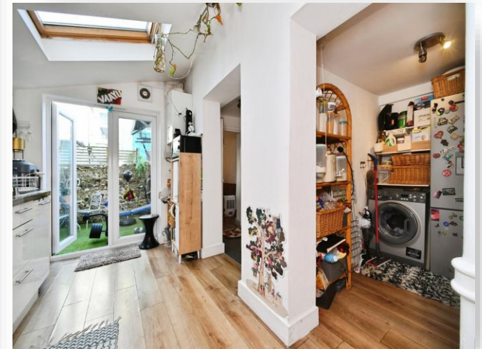
5a Franklin Road, Brighton BN2 3AD