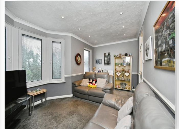
Bear Road, Brighton BN2 4DB