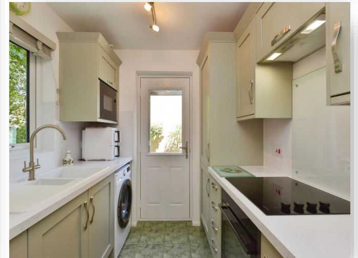
Capian Walk, Two Mile Ash Milton Keynes MK8 8HH