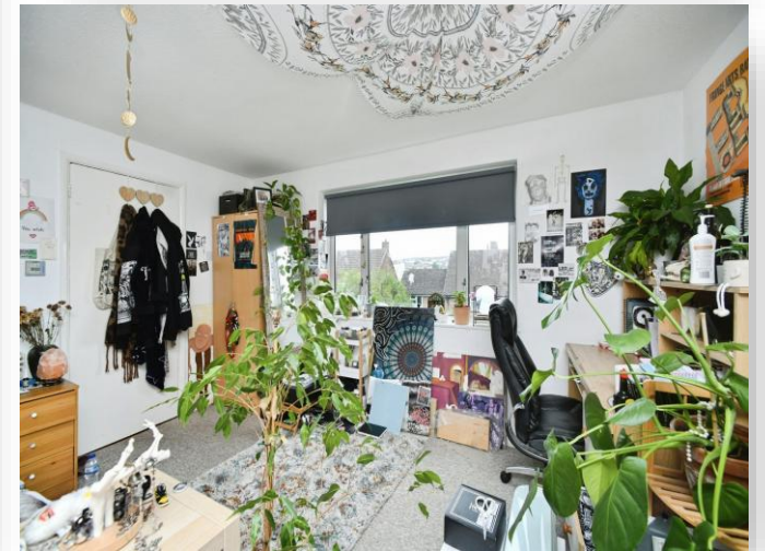
Thompson Road, Brighton BN1 7BH