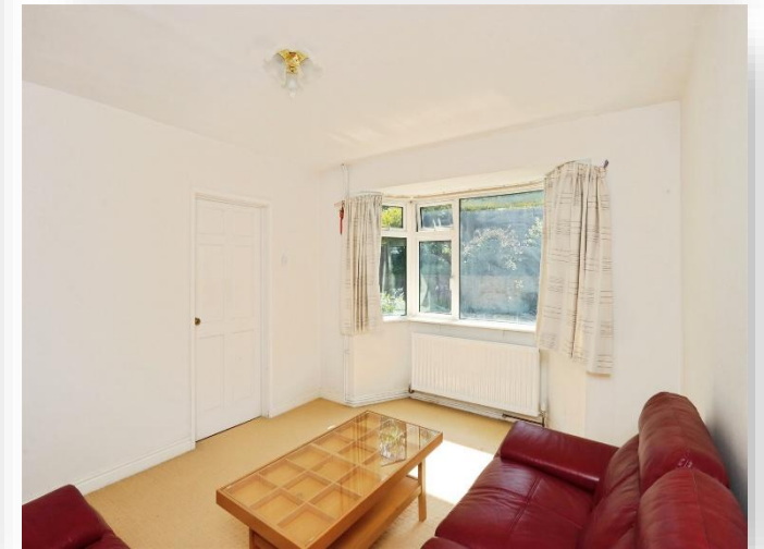
Beaconsfield Road, Rotherham S60 3HB