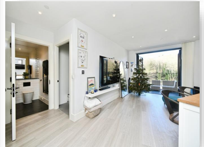
The Furlong, Brighton BN2 4FW