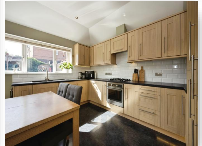
Highfield Road, Leighton Buzzard, LU7 3LZ