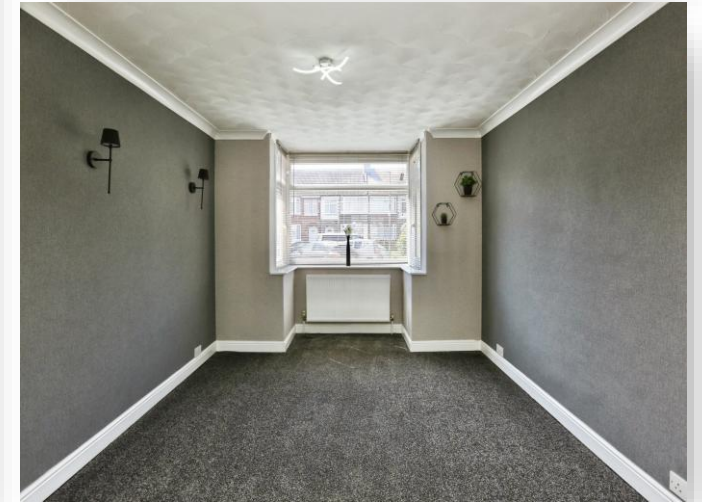
Tewkesbury Avenue, Gosport, PO12 4JA