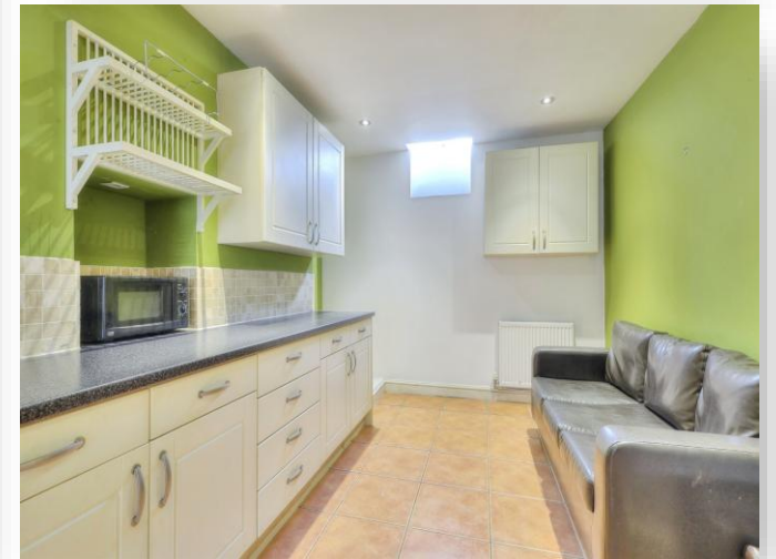
Lower Thrift Street, NORTHAMPTON NN1 5HP