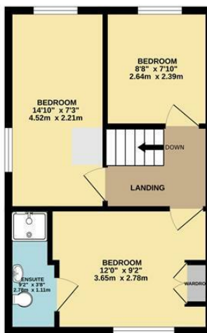
TOTAL FLOOR AREA: 1000 sq.ft. (92.9 sq.m.) approx.

Whilst every attempt has been made to ensure the accuracy of the floorplan contained here, measurements of doors, windows, rooms and any other items are approximate and no responsibility is taken for any error, omission or mis-statement. This plan is for illustrative purposes only and should be used as such by any prospective purchaser. The services, systems and appliances shown have not been tested and no guarantee as to their operability or efficiency can be given. Made with Mergex ©2005