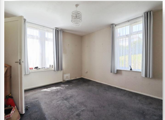
College Road, Barry CF62 8HQ