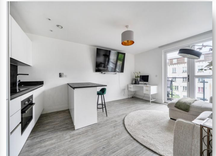
Apartment 34 Exclusive House, Oldfield Road, Maidenhead SL6 1NQ