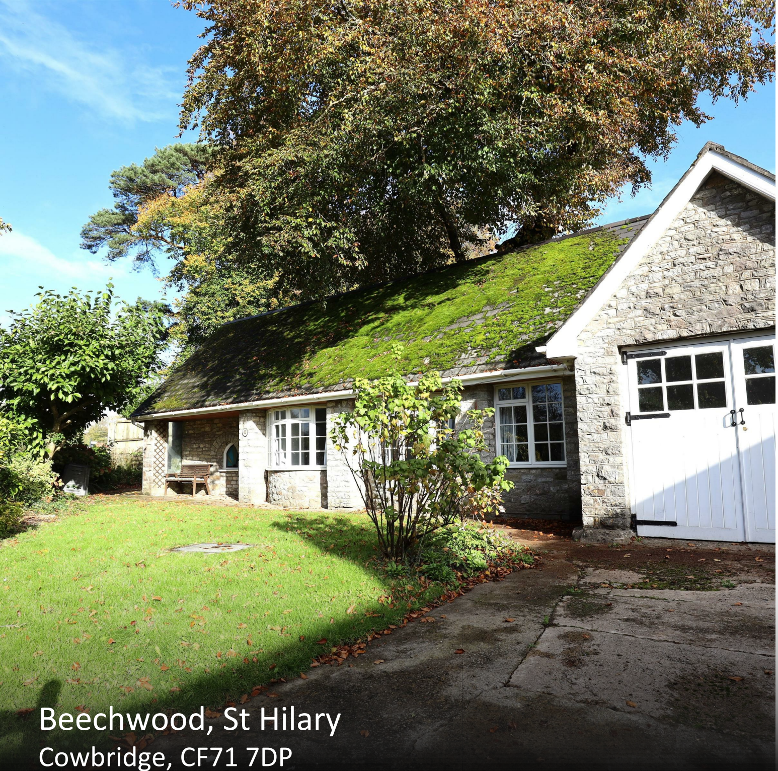
Beechwood, St Hilary Cowbridge, CF71 7DP