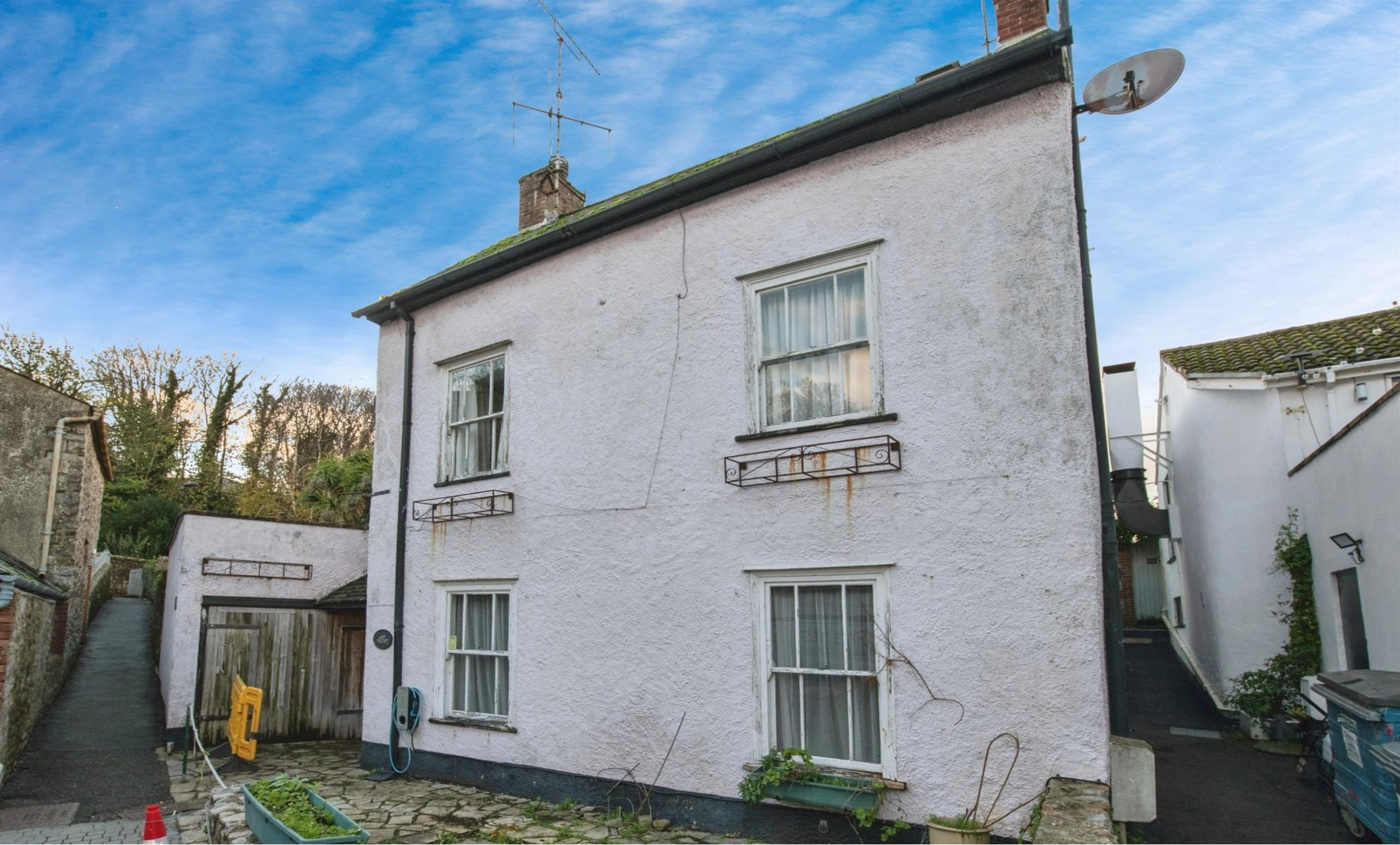
Old Lynch, Mill Lane, Lyme Regis DT7 3PU